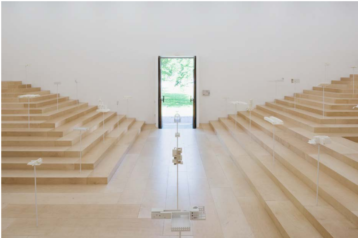
The School of Athens, Neiheiser Argyros

academic common spaces as architectural specimens – identified, categorised, and made available for analysis and comparison. Mounted on vertical steel bars, these models will be organized in a grid that will fill the pavilion equally in all directions, categorised by time, typology, scale, and spatial strategy.