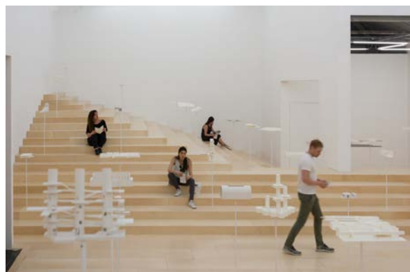
The School of Athens, Neiheiser Argyros

As part of the exhibition, a symposium on the history, present, and possible future of the academic commons will take place at the National Pavilion of Greece on Saturday, 26th May 2018 from 12:30 - 6:00 pm. Each speaker will present a single project that addresses the theme of the exhibition, " The School of Athens ".