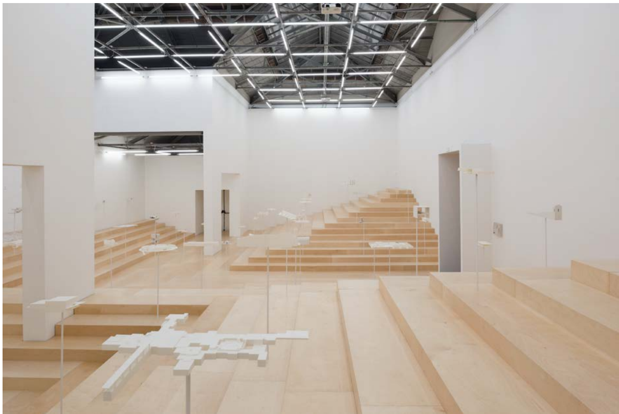
The School of Athens, Neiheiser Argyros

The School of Athens , the Greek Pavilion exhibition at the Biennale Architettura 2018, examines the architecture of the academic commons - from Plato's Academy to contemporary university designs. Referencing Raphael's famous fresco, the Pavilion is transformed into a stepped landscape - an open, informal, and common space that will invite visitors to interact with fifty-six 3D-printed models of educational spaces from around the world and different architectural periods, both built and unbuilt. The exhibition will take place from May 26 th to November 25 th , 2018 (Preview Thursday, 24 th May at 17:15) in the Giardini della Biennale, Venice, Italy.