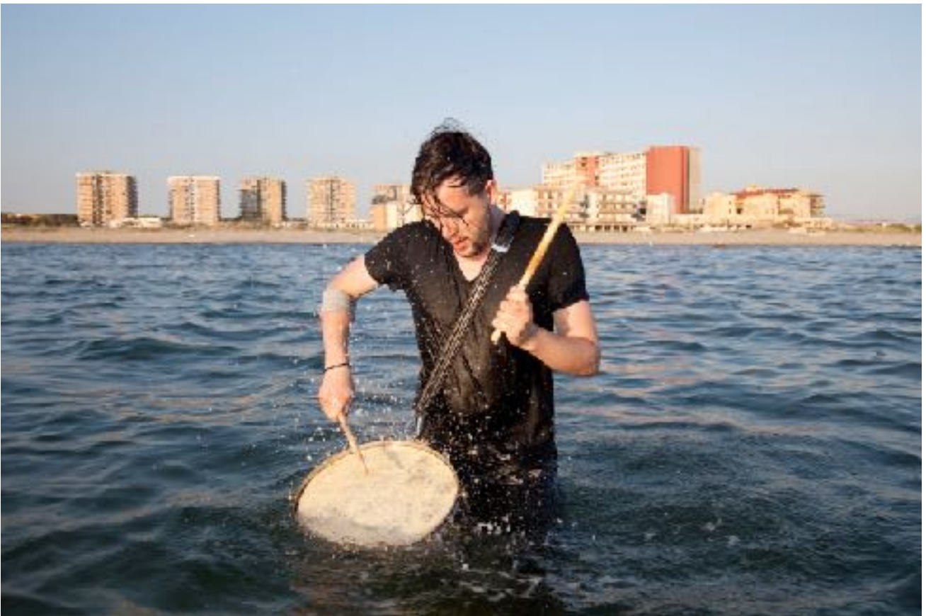
Castle Volturno, 2010, Raphael Sbrzesny

Tinos Quarry Platform / Cultural Foundation of Tinos Tinos, Greece • 05.07.2017