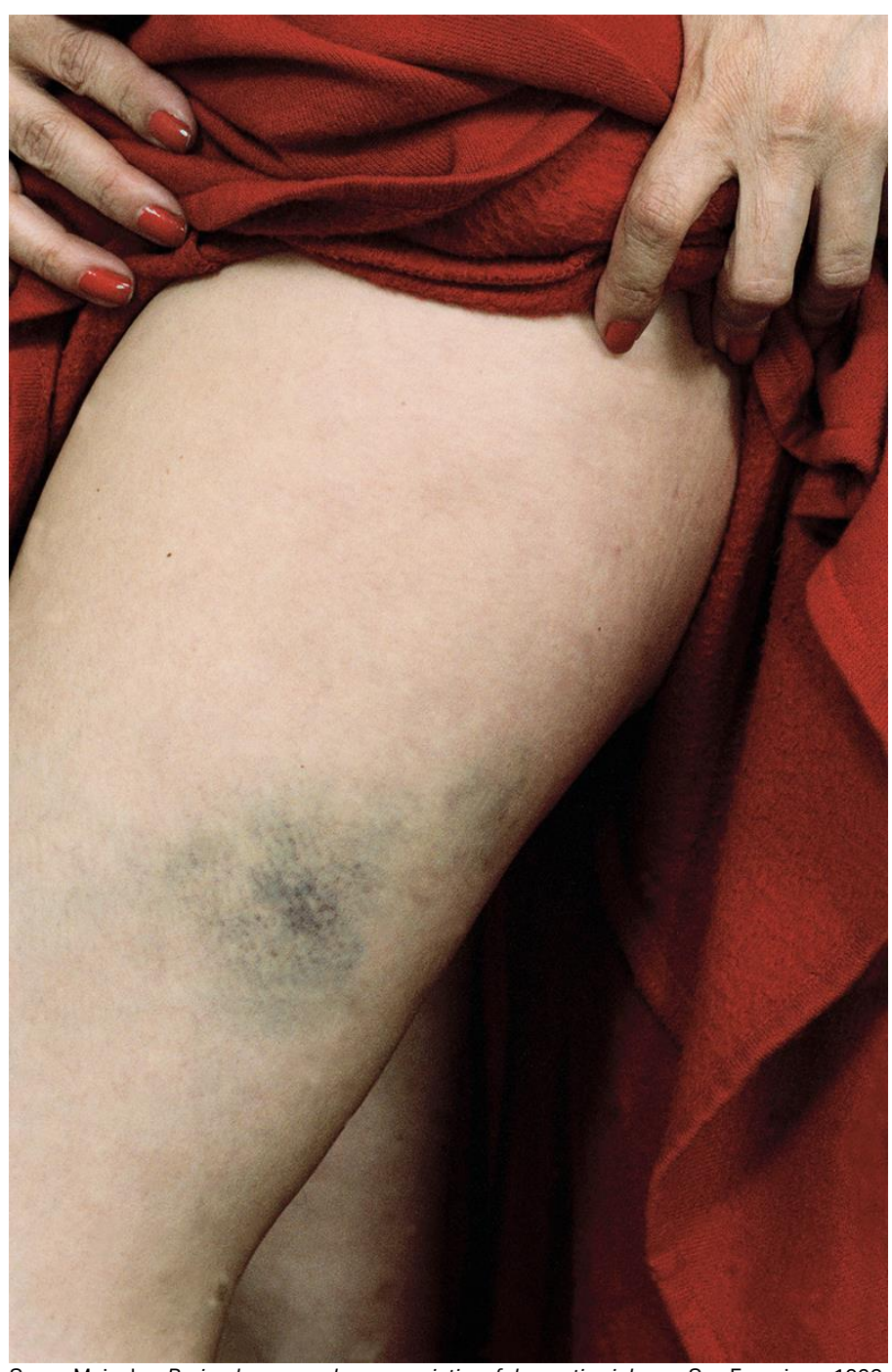
Susan Meiselas. Bruised woman who was a victim of domestic violence , San Francisco, 1992. Colour photograph. © Susan Meiselas/Magnum Photos

Curated by Studio Susan Meiselas Coordination: Stamatis Schizakis, Ioli Tzanetaki Floor 3, Project Room 1 Until 10.11.2024