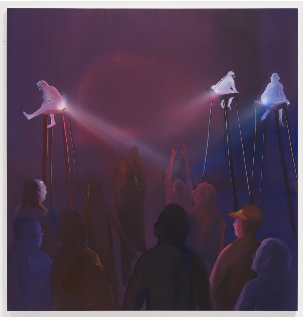
Tala Madani Shitty Disco, 2024. Oil on linen. 152.4 × 147.32 cm.