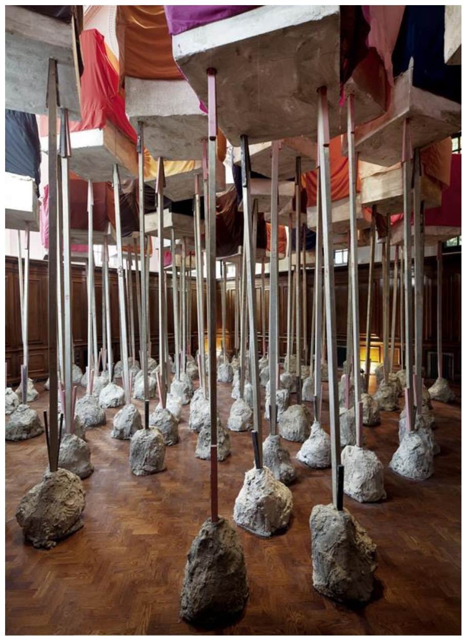
Phyllida Barlow, RIG: untitled; blocks 2011 (detail). Polystyrene, fabric, timber, cement. Overall dimensions: 720 × 1190 × 1040 cm. © Phyllida Barlow Estate. Courtesy the Phyllida Barlow Estate, Hauser & Wirth, D.Daskalopoulos Collection. Photo: Peter Mallet

{\sf EM}\Sigma{\sf T} and NEON are pleased to present a major, monumental installation by Phyllida Barlow (1944–2023), from the D.Daskalopoulos Collection, making it the first presentation of the artist's work in Greece.