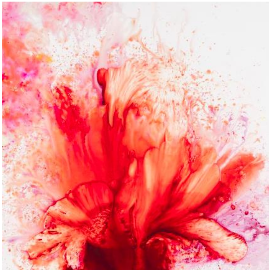
Penny Siopis, For Dear Life, 2020. Glue and ink on canvas, 190 × 90 cm. Private Collection, Cape Town.

EMΣT is pleased to present For Dear Life. A Retrospective , the first major museum retrospective in Europe of the work of Penny Siopis, one of the most important artistic voices of her generation. The exhibition is the flagship event of the third part of What If Women Ruled the World? , a year-long cycle of exhibitions centred on women artists and artists who identify as female.