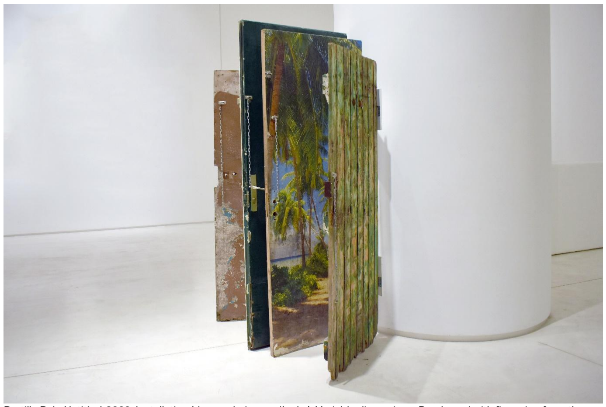
Bertille Bak, Untitled , 2009. Installation (doors, chains, padlocks). Variable dimensions. Purchased with financing from the NEON FUND FOR EM \Sigma T, 2017.

Bertille Bak's solo exhibition is being organised in the context of SPOTLIGHT, a new programme launched by EM\Sigma T that presents the work of one artist from its collection, allowing greater insight into their artistic practice. SPOTLIGHT features works from the museum's collection, as well as loans from other institutions and the artists themselves.